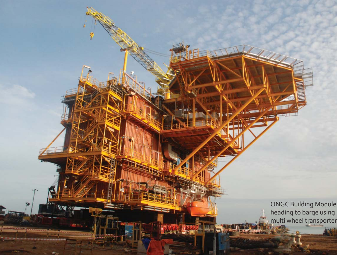
ONGC Building Module heading to barge using multi wheel transporter

Founded in 1980, Gunanusa commenced operations in 1983. Since then, it has secured work not only from the Indonesian market but from other part of the world such as Thailand, India, Brunei and USA.