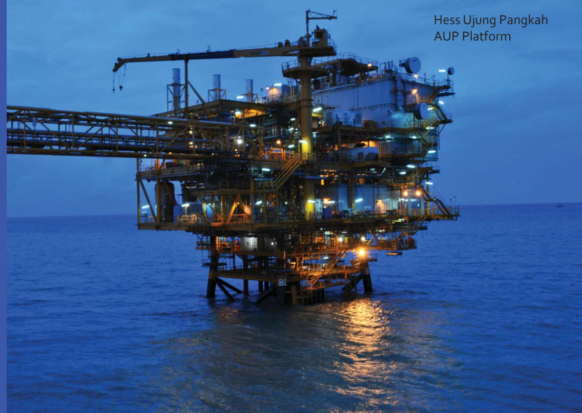
Hess Ujung Pangkah AUP Platform

platforms (VR-A and VR-B), each deck weight is 1200 tons, including jackets (1900 tons each) and piles (1300 tons each). The BP Tangguh facilities have a special requirement, 40 years long term corrosion protection, which Gunanusa accomplished by coating the structures with Thermally Spray Aluminum (TSA).