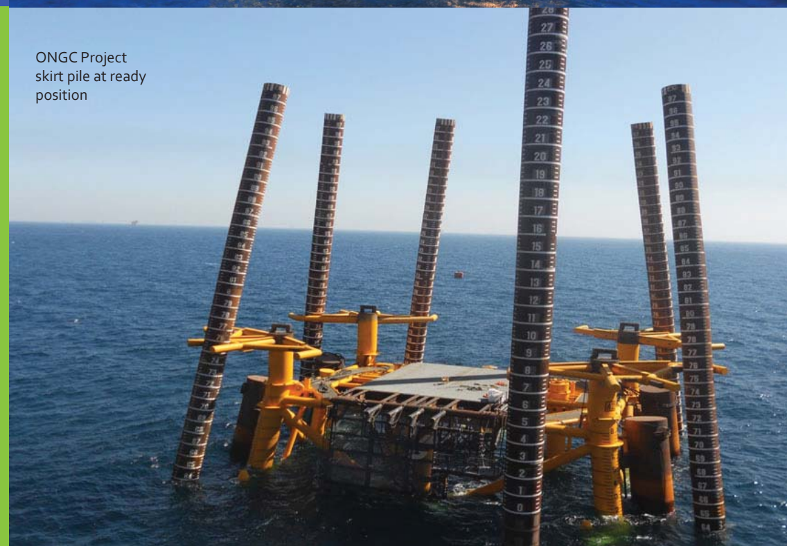
ONGC Project skirt pile at ready position

height. Gunanusa completed the project in 8 month and loaded out in April 2005 and shipped around the world to city of New York for final installation.